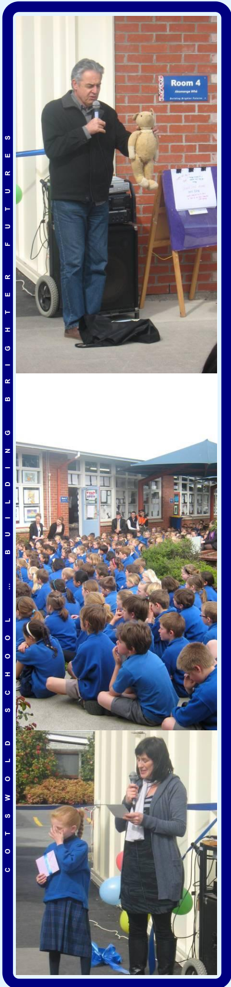
COTSWOLD SCHOOL ... BUILDING BRIGHTER FUTURES